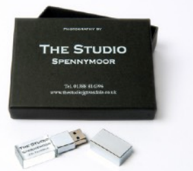
Boxed USB Memory Stick

Payment can be made in instalments before your wedding