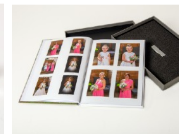
Hardback Proof Book