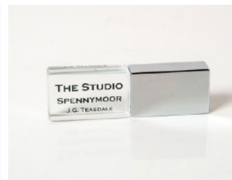
USB Memory Stick